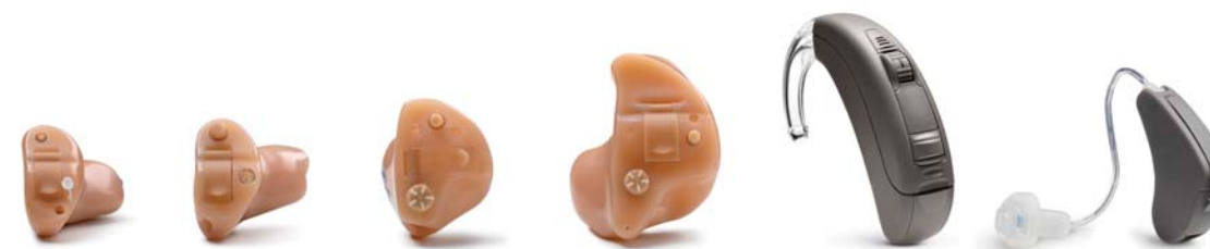
Beltone Change is available in our most popular shell styles: